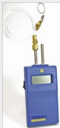
GC Pressure Meter