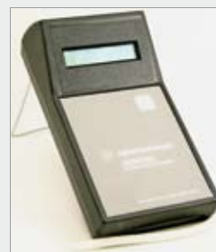
v-kit Gas Flowmeter

v-tools are the recommended tools for GCMS OQ and integrate with the v-kit software and procedures. The range of tools has been designed to ensure accuracy as well as to help to speed up the instrument testing process. The calibration on all tools is valid for one year and includes traceable calibration certificates.