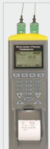
v-kit 2-channel thermometer